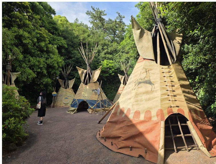
Disney Structure Japan

One island hosted members of the Rastafarian Community from Nigeris out of respect and in commemoration of consciousness that kept us aware, generations of these individuals did not fail to deliver, in contrast to the false narratives issued across the region for centuries, cemented by the dimmest politicians during the miseducation phase, still in place and was never erased, but trafficking is uppermost in their minds, not educating populations or reconnecting them to their real story. The observance culminated with further celebration in NYC. I would think everyone will distance themselves after what Barbados did in response and in clear opposition to the symbol of Afrikan freedom. How could anyone with a conscience, a modicum of common sense condone this high handed vileness, coming from a colonial politician filled to the brim with such arrogance. Who apparently earmarked herself to mislead the entire Caribbean into an undeserved hell filled with more chaos and turbulence and no exit in sight. Fortunately for us, they are weakening significantly so every strategy is disintegrating on impact after many decades of overall abuse, over four generations, especially the most recent failed attempt at taking charge of the region to incapacitate everyone. Amen Ra