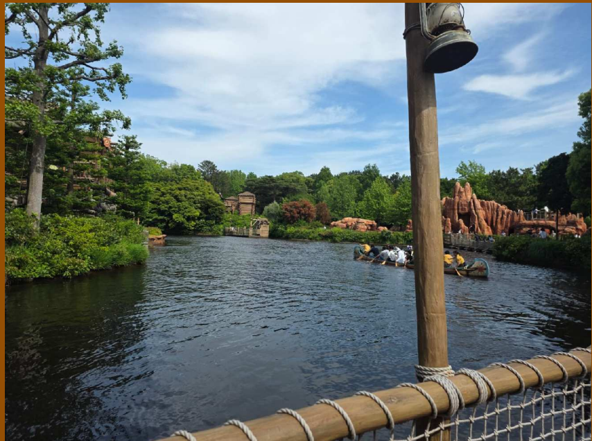
Disney Waterway, Japan