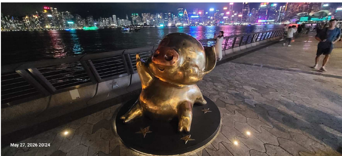
Hong Kong- Harbor Front

We kept saying the reparations scam was a distraction masking true intent, a shroud. No one will put reparations funds to the tune of trillions of dollars in the hands of local politicians with reports of human trafficking, human rights abuses against Afrikan descended people, lodged at the UN, no matter how many hours-long speeches they puke everywhere. Nothing was going to stop them from their mission, not even the public arrest of a Ugandan Judge based at the UN but studying for a doctorate in law at Oxford in the UK; and used diplomatic channels to import a young Ugandan woman as a slave. She was convicted and sentenced for modern day slavery in March of 2025. That was no deterrent for those with their eyes on the UN Secretary General's chair looking for full immunity, a full ride free from prosecution for crimes committed.