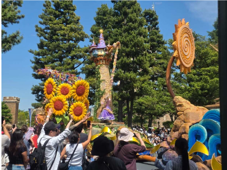
Disney - Japan