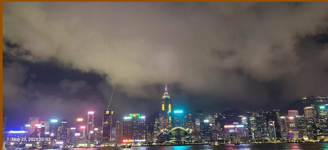
Harbor Front, Hong Kong