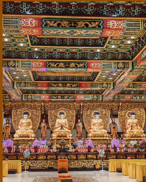
Mural - Hong Kong