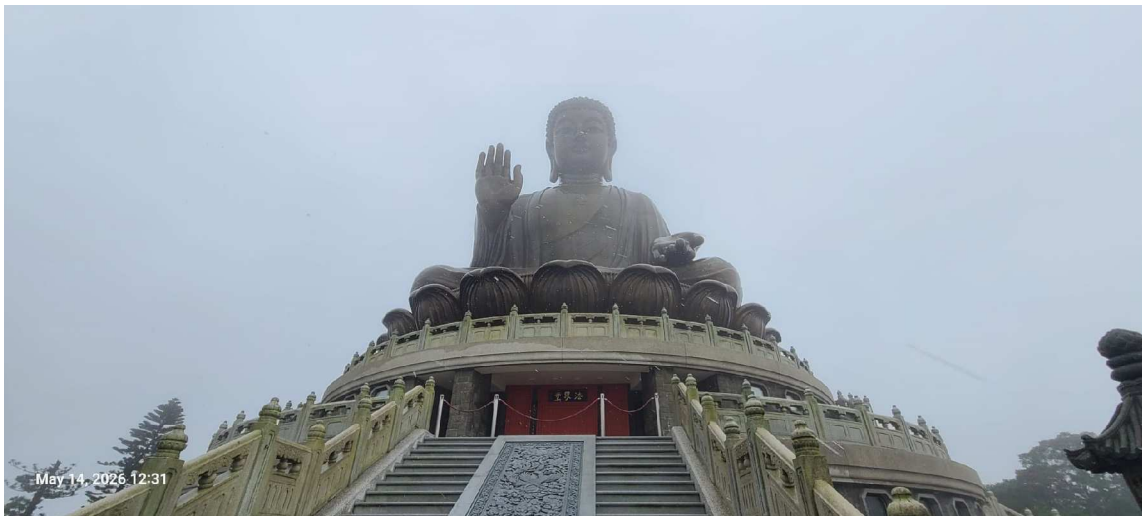
Buddha - Hong Kong

The plethora of things that have gone horrifically wrong in this diaspora region lately, there was no surprise when a cascading, Karma escorted hell rained down on disloyal politicians. An indication that everyone must pay closer attention, especially on the continent. Safety is now paramount as the bloodletting escalates, since all the grand delusions of the UN Secretary General's chair and UNSC seat, with the highest levels of hoped for immunity have all become undone. With true intent written everywhere for all to read, it is back to the drawing board of schemes minus any world stage props, which are equally unpleasant. There will be no more warnings issued to Barbados so they are free to continue their fast and loose marathon and find out eventually, since everyone has caught on to the dissimulation. They can and will have complete disclosure from all vantage points. It is no longer just one voice in the wilderness.