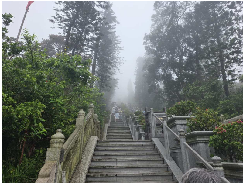
Buddha Steps - Hong Kong

Barriers Taken Down - Protecting Children and Young People From a Life Sentence of Government Imposed Mental Imprisonment and Torture