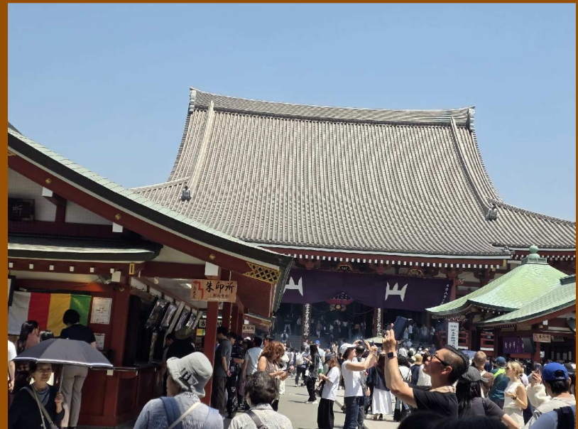
Market - Japan