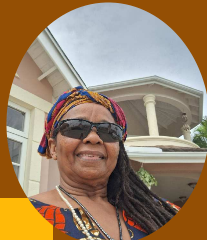
Malkia Wa Walfalme