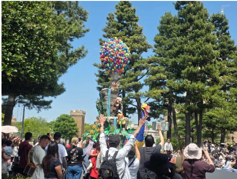
Disney Japan Float

When pure evil radiates from certain people and unseen by most who love listening to false chatter intended to bamboozle slow minds and light heads, they can operate undiscovered throughout dusty lives. A societal, generational stain not easily removable once its roots have spread since the 17th century, it was during that age some of the enslaved became slavers, as was fashionable. and at the very end of their lives, willed the oppressed, helpless and exploited to other favorite slaves, in a linked continuation of the enslavement story distributed socially, undiluted.