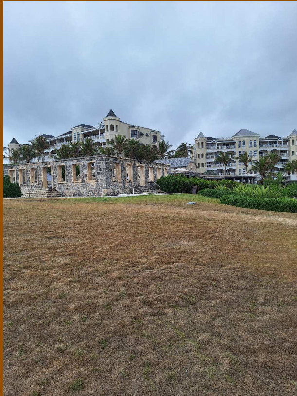
Crane, St. Philip